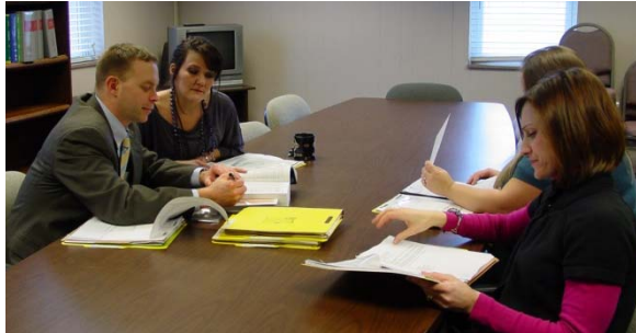
Family Violence Unit

An area this office has seen greatly expanded in our office is filing of criminal violations of township zoning codes. As the townships grow, zoning enforcement has become an increasingly necessary issue. Since my office prosecutes all misdemeanor violations in the unincorporated areas of Fairfield County, this includes township zoning issues. The County Prosecutor's Office handles all other civil aspects of the townships legal needs.