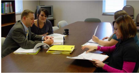
Family Violence Unit

An area this office has seen greatly expanded in our office is filing of criminal violations of township zoning codes. As the townships grow, zoning enforcement has become an increasingly necessary issue. Since my office prosecutes all misdemeanor violations in the unincorporated areas of Fairfield County, this includes township zoning issues. The County Prosecutor's Office handles all other civil aspects of the townships legal needs.